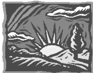
Behold! I make all things new!

Just what happens to the individual and the community as a result of Reconciliation is directly related to the baptismal call to be the Body of Christ in the world. It has the power to transform the world!