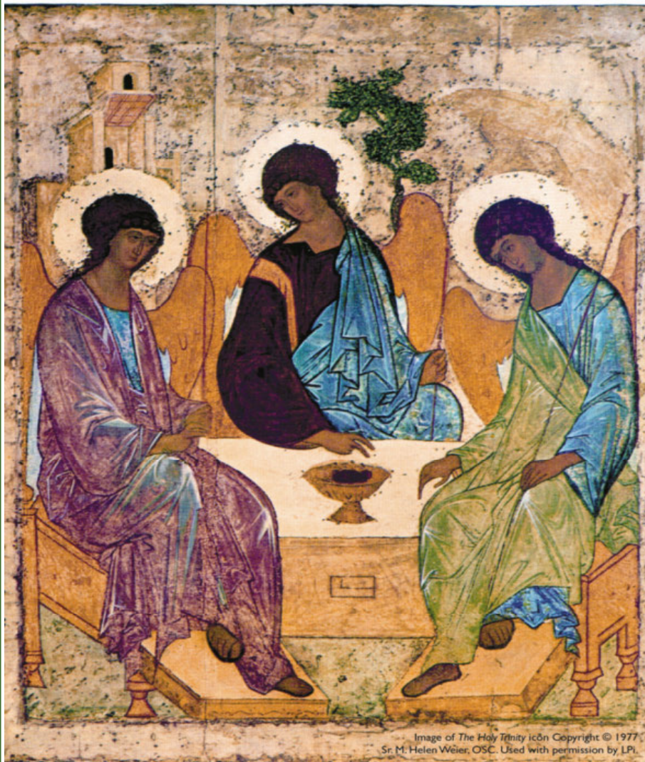
Image of The Holy Trinity icon

Blessed Trinity Parish is an open and welcoming Catholic community, centered in the Eucharist and celebrating God's gift of Diversity. We bring God's love to one another and support one another in responding to the challenge of living the Gospel. We strive to deepen participation and encourage all parishioners to take ownership for the everyday life of their church, especially Spiritual Growth, Community Life, the Building of a Just Society, and Service to All God's People.