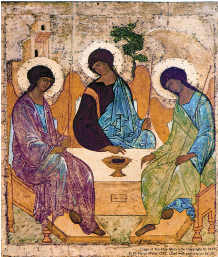
Image of The Holy Trinity icon

Blessed Trinity Parish is an open and welcoming Catholic community, centered in the Eucharist and celebrating God's gift of Diversity. We bring God's love to one another and support one another in responding to the challenge of living the Gospel. We strive to deepen participation and encourage all parishioners to take ownership for the everyday life of their church, especially Spiritual Growth, Community Life, the Building of a Just Society, and Service to All God's People.