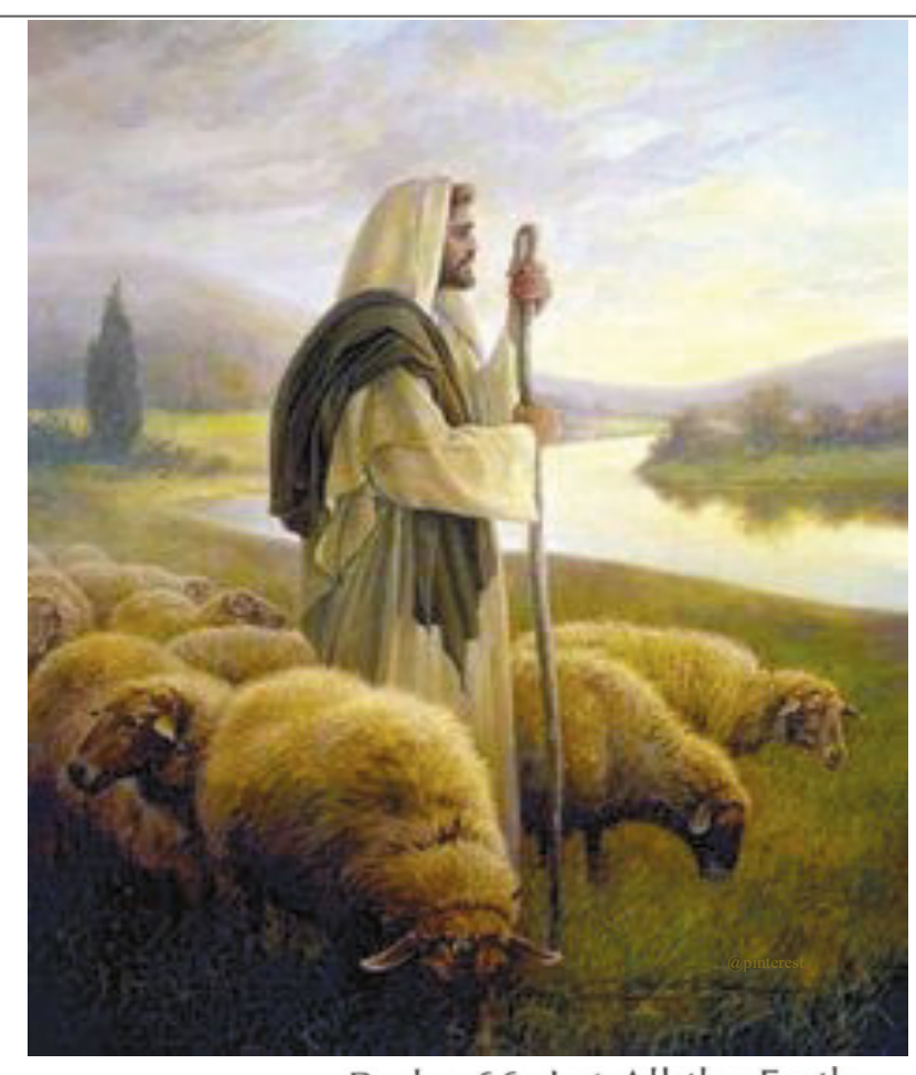
Psalm 66: Let All the Earth