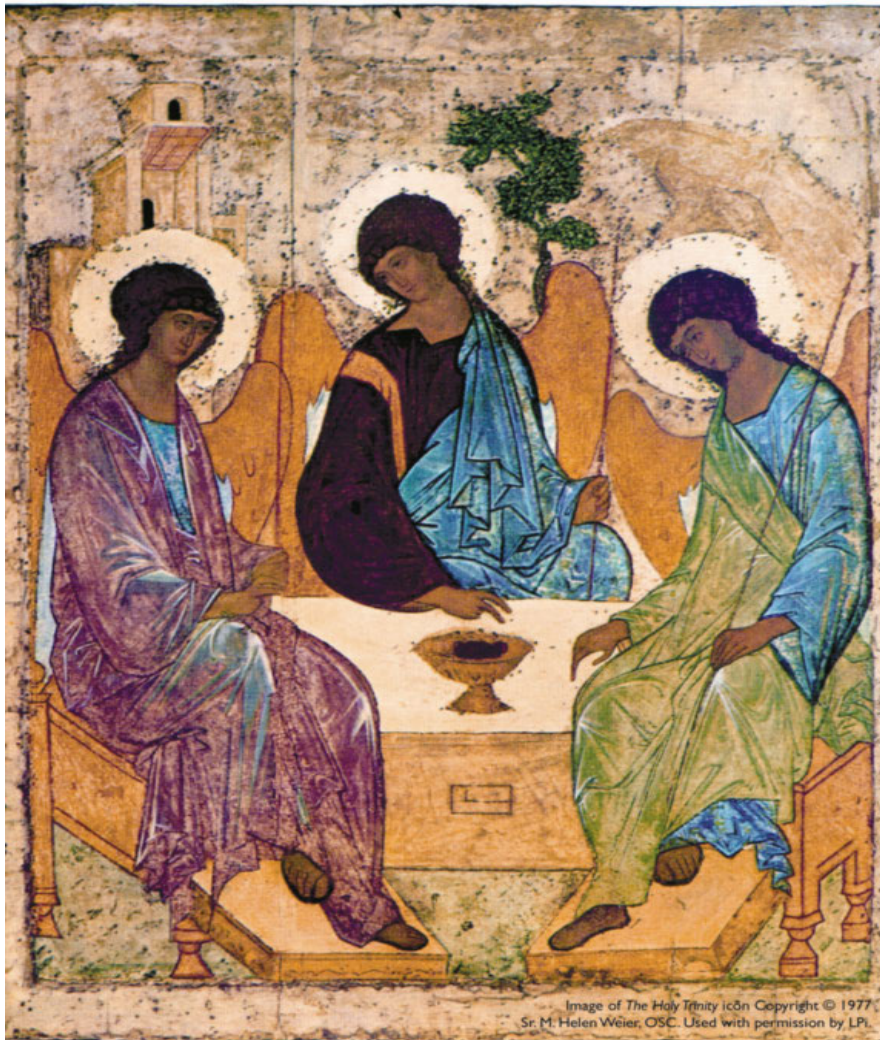
Image of The Holy Trinity icon