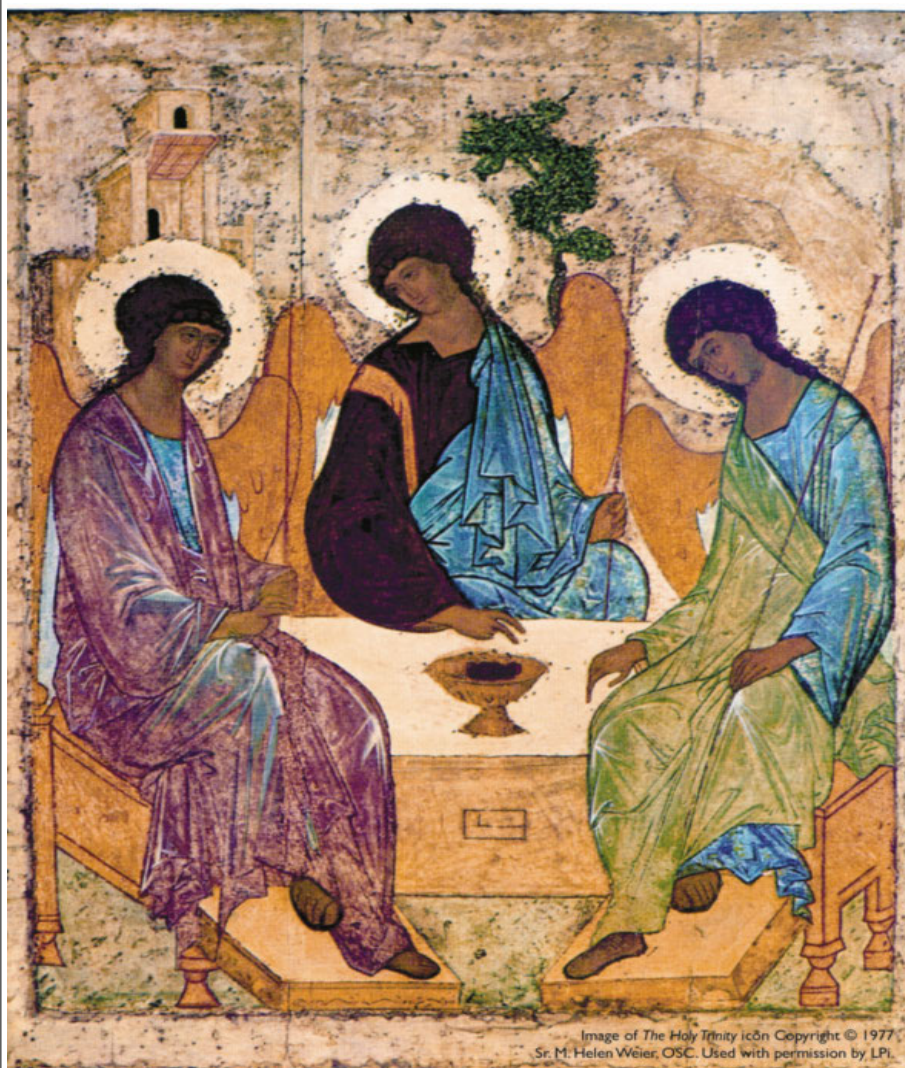
Image of The Holy Trinity icon

Blessed Trinity Parish is an open and welcoming Catholic community, centered in the Eucharist and celebrating God's gift of Diversity. We bring God's love to one another and support one another in responding to the challenge of living the Gospel. We strive to deepen participation and encourage all parishioners to take ownership for the everyday life of their church, especially Spiritual Growth, Community Life, the Building of a Just Society, and Service to All God's People.