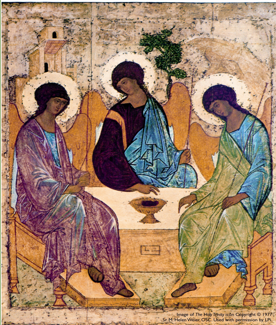
Image of The Holy Trinity icon

Blessed Trinity Parish is an open and welcoming Catholic community, centered in the Eucharist and celebrating God's gift of Diversity. We bring God's love to one another and support one another in responding to the challenge of living the Gospel. We strive to deepen participation and encourage all parishioners to take ownership for the everyday life of their church, especially Spiritual Growth, Community Life, the Building of a Just Society, and Service to All God's People.