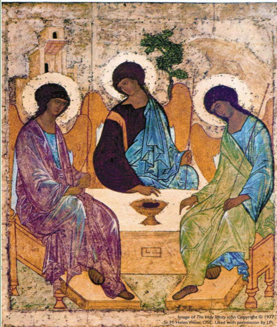
Image of The Holy Trinity icon

Blessed Trinity Parish is an open and welcoming Catholic community, centered in the Eucharist and celebrating God's gift of Diversity. We bring God's love to one another and support one another in responding to the challenge of living the Gospel. We strive to deepen participation and encourage all parishioners to take ownership for the everyday life of their church, especially Spiritual Growth, Community Life, the Building of a Just Society, and Service to All God's People.