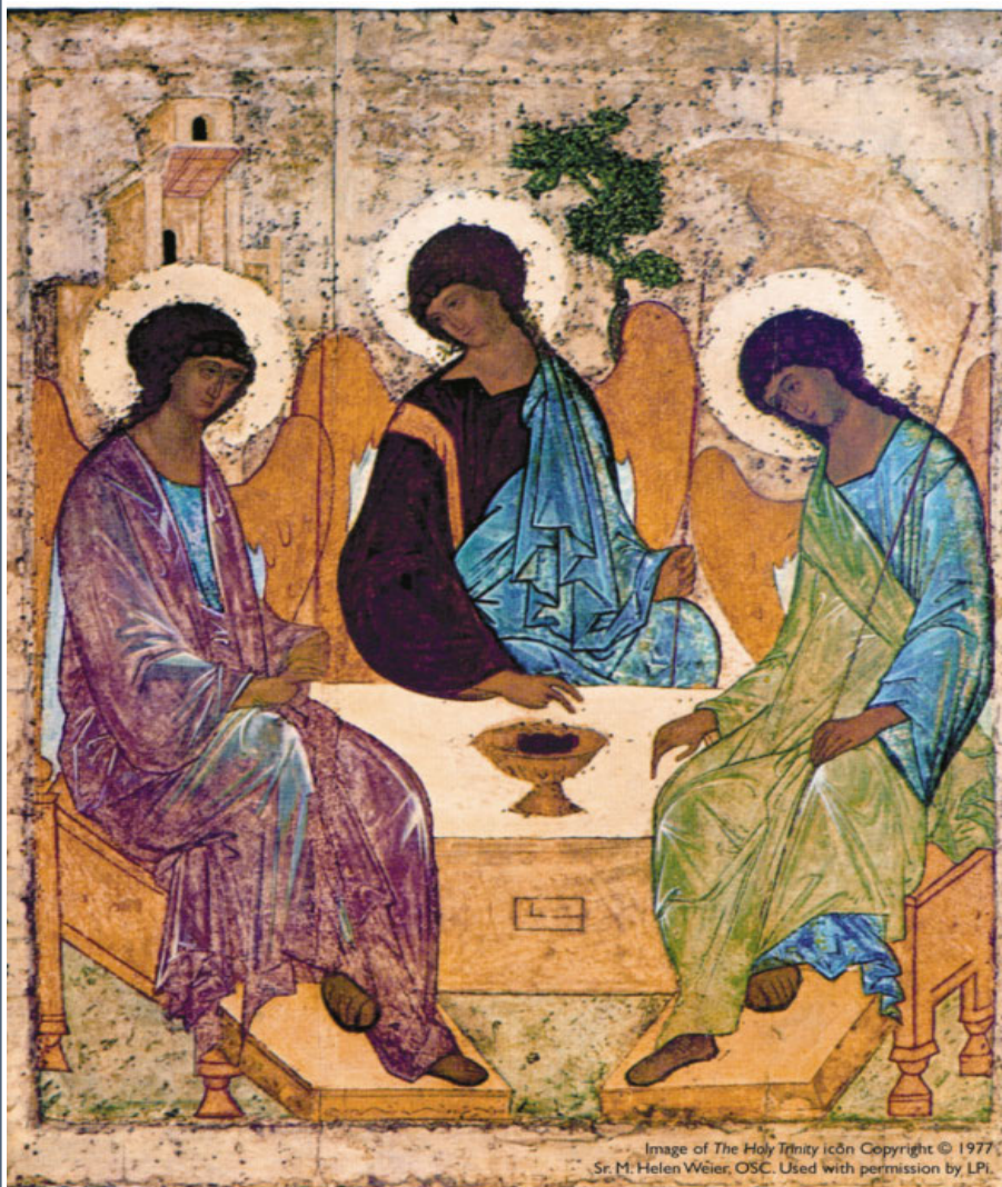
Image of The Holy Trinity icon

Blessed Trinity Parish is an open and welcoming Catholic community, centered in the Eucharist and celebrating God's gift of Diversity. We bring God's love to one another and support one another in responding to the challenge of living the Gospel. We strive to deepen participation and encourage all parishioners to take ownership for the everyday life of their church, especially Spiritual Growth, Community Life, the Building of a Just Society, and Service to All God's People.