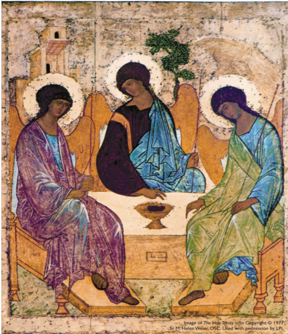
Image of The Holy Trinity icon

Blessed Trinity Parish is an open and welcoming Catholic community, centered in the Eucharist and celebrating God's gift of Diversity. We bring God's love to one another and support one another in responding to the challenge of living the Gospel. We strive to deepen participation and encourage all parishioners to take ownership for the everyday life of their church, especially Spiritual Growth, Community Life, the Building of a Just Society, and Service to All God's People.