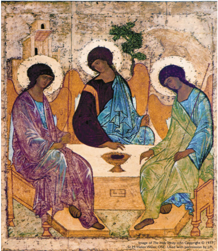
Image of The Holy Trinity icon

Blessed Trinity Parish is an open and welcoming Catholic community, centered in the Eucharist and celebrating God's gift of Diversity. We bring God's love to one another and support one another in responding to the challenge of living the Gospel. We strive to deepen participation and encourage all parishioners to take ownership for the everyday life of their church, especially Spiritual Growth, Community Life, the Building of a Just Society, and Service to All God's People.