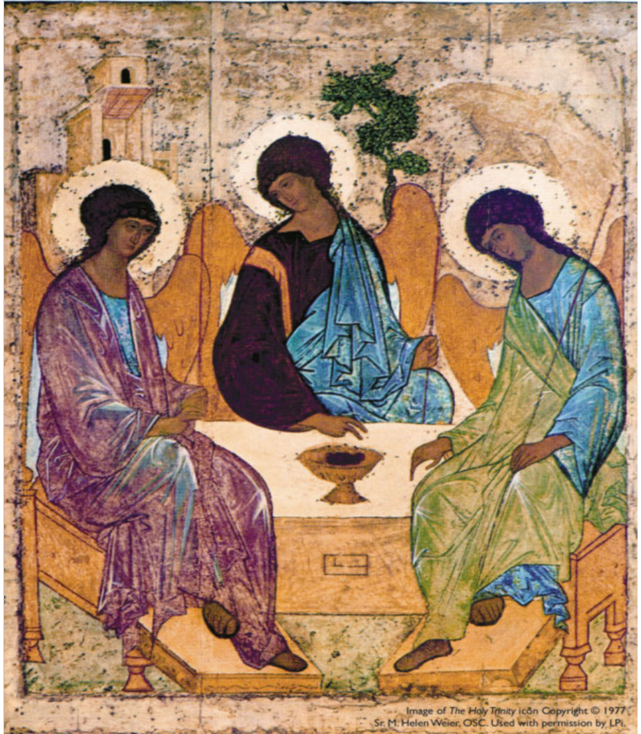
Image of The Holy Trinity icon

Blessed Trinity Parish is an open and welcoming Catholic community, centered in the Eucharist and celebrating God's gift of Diversity. We bring God's love to one another and support one another in responding to the challenge of living the Gospel. We strive to deepen participation and encourage all parishioners to take ownership for the everyday life of their church, especially Spiritual Growth, Community Life, the Building of a Just Society, and Service to All God's People.