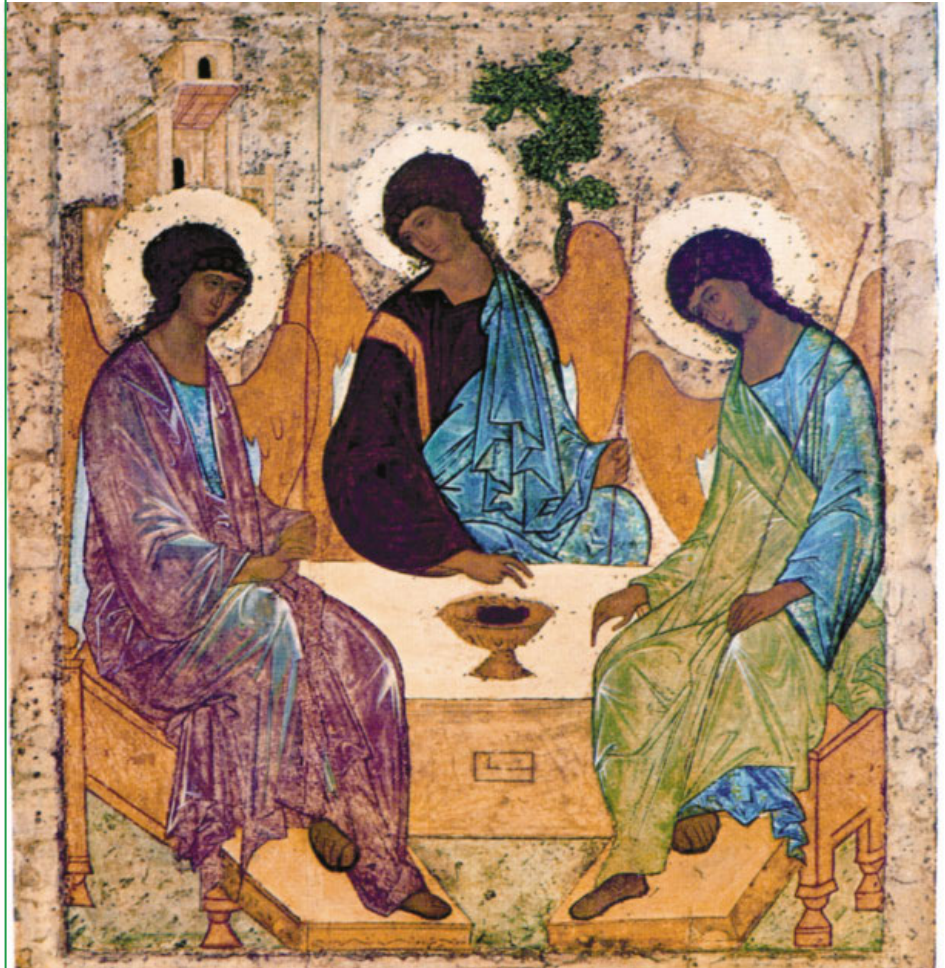
Psalm 30: I Will Praise You, Lord

Blessed Trinity Parish is an open and welcoming Catholic community, centered in the Eucharist and celebrating God's gift of Diversity. We bring God's love to one another and support one another in responding to the challenge of living the Gospel. We strive to deepen participation and encourage all parishioners to take ownership for the everyday life of their church, especially Spiritual Growth, Community Life, the Building of a Just Society, and Service to All God's People.